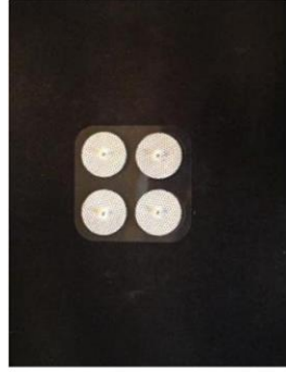
Columbia SNAP600 electrode (1" diameter)