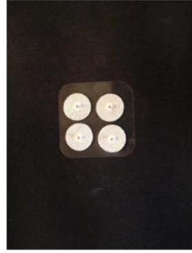
Columbia 700 electrode (.86" diameter)