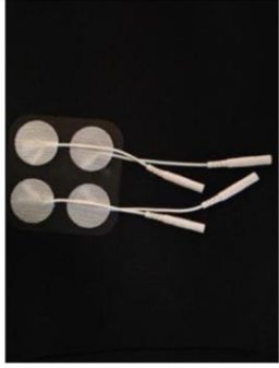
Columbia 600 electrode (1" diameter)