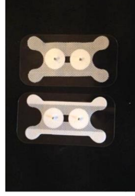
Columbia 600B electrode (.86" diameter)