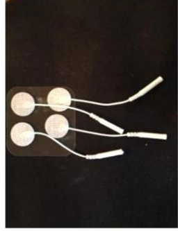
Columbia 600M electrode (.86" diameter)