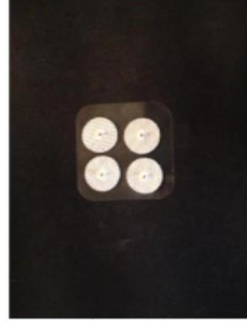
Columbia 700 electrode (.86" diameter)