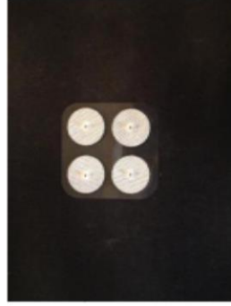
Columbia SNAP600 electrode (1" diameter)