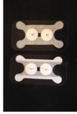
Columbia 600B electrode (.86" diameter)