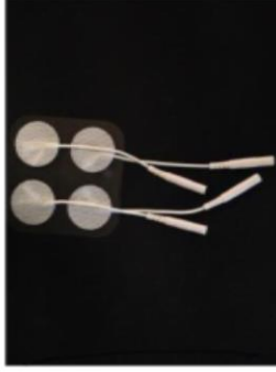
Columbia 600 electrode (1" diameter)