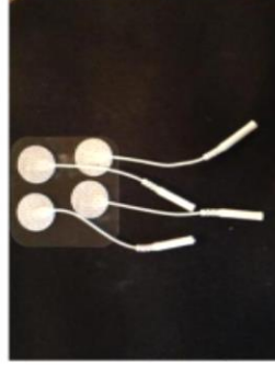
Columbia 600M electrode (.86" diameter)