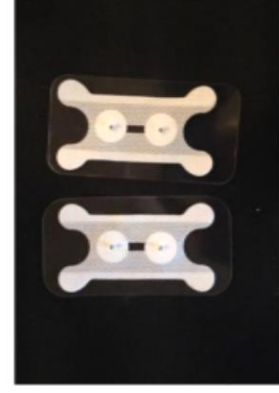
Columbia 700P electrode (.6875" diameter)